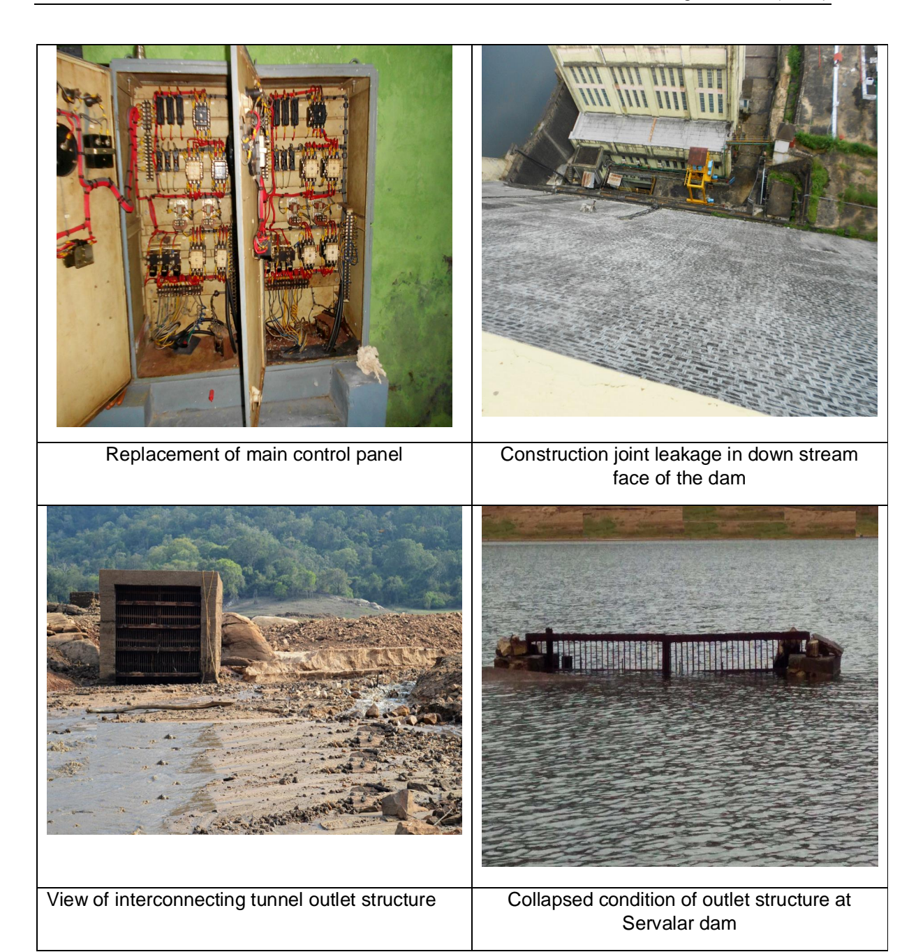
Figure 1.1: Selected Photographs of Improvement / Intervention area