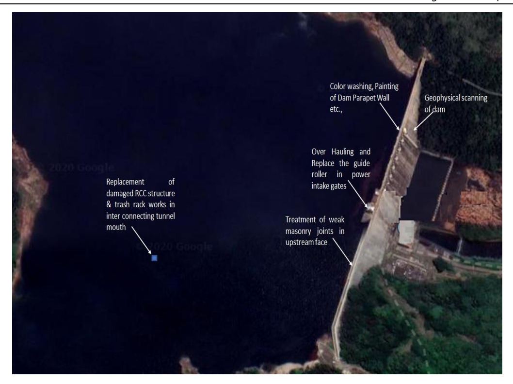
Figure 1.2: Project Area showing major intervention locations of Servalar dam