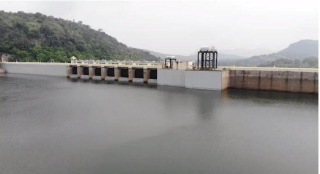
View of Downstream face of the Dam